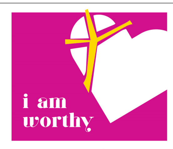
july 16-19, 2026 🕇 des moines, iowa

The W-ELCA Triennial Gathering is scheduled for July 16-19, 2026, in Des Moines, Iowa.