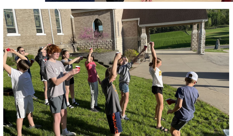
May 8th-end of year party and outdoor games.