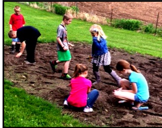
On their last day of Sunday School the kids helped plant pumpkin seeds in the garden!